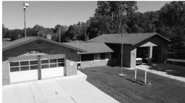
FIRE STATION NO. 52

2701 HOPKINS AVENUE LANSING, MICHIGAN 48912 (517) 482-2088