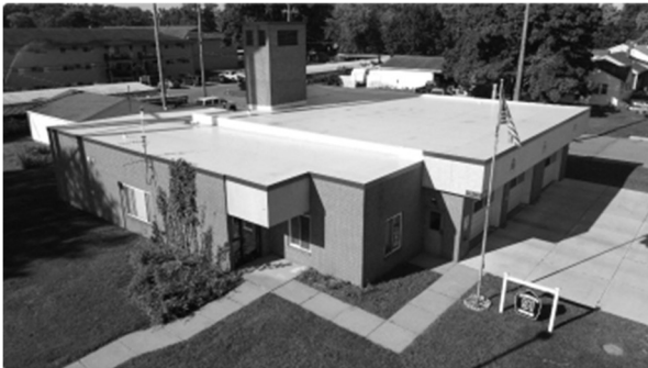
FIRE STATION NO. 51 & HEADQUARTERS

3301 WEST MICHIGAN AVENUE LANSING, MICHIGAN 48917 (517) 485-5443